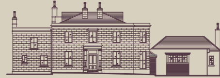
South-East elevation (Front - To Mill Lane)