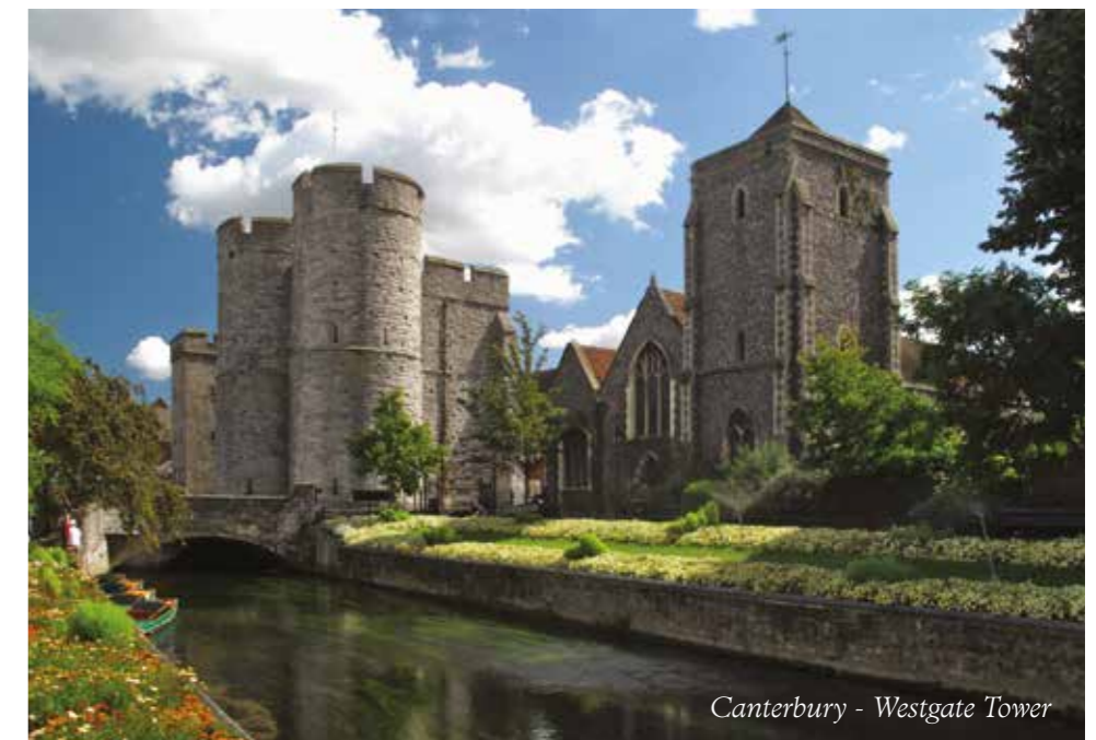
Canterbury - Westgate Tower