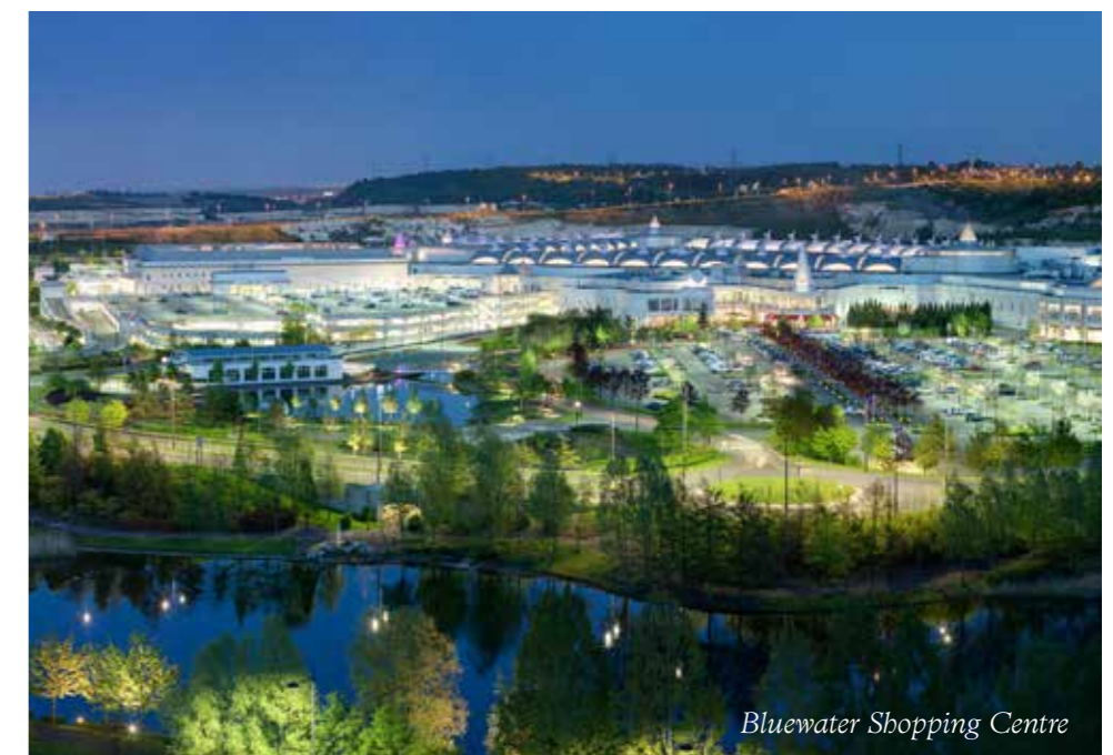
Bluewater Shopping Centre